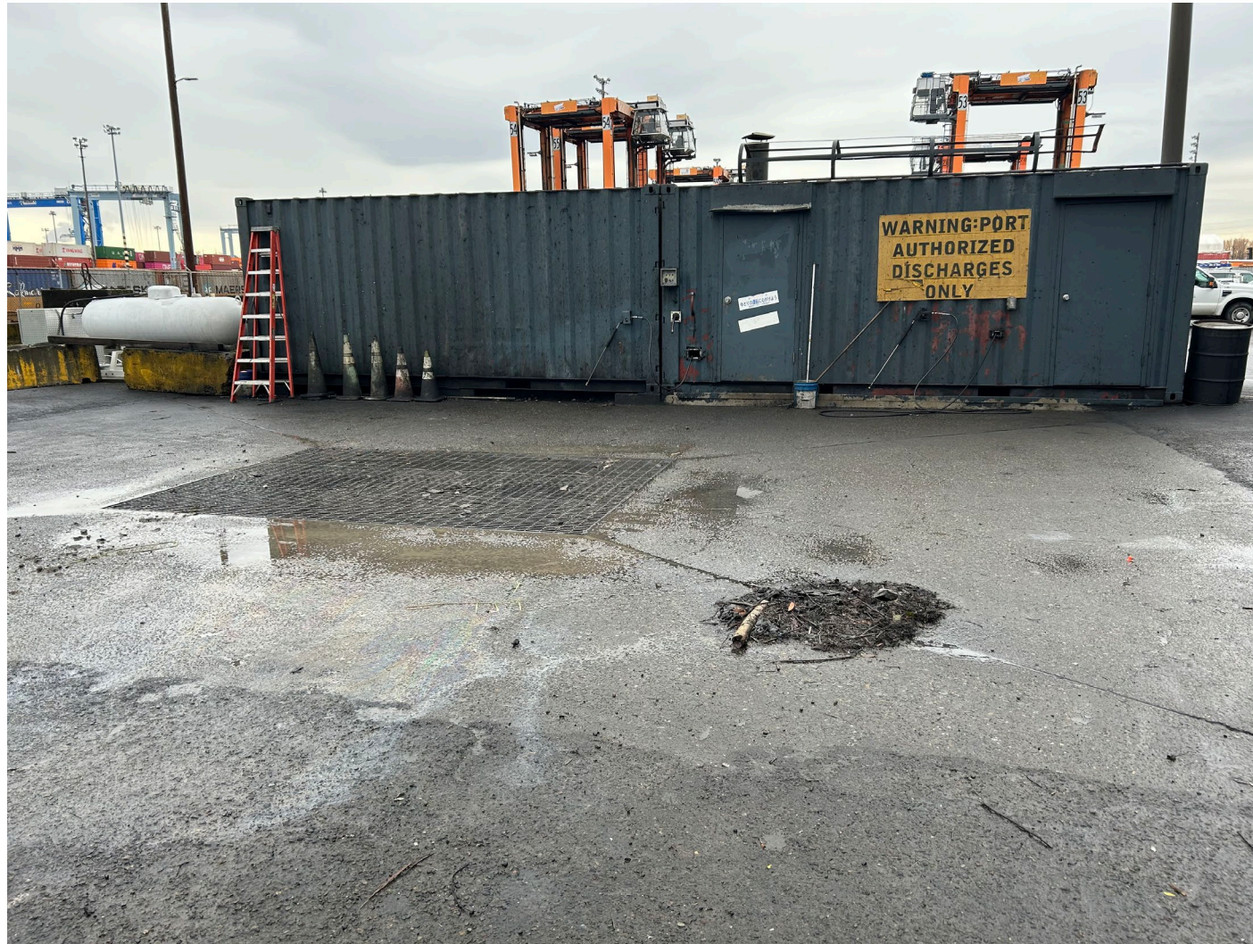
Dump Pit – Beginning of the Port's Wastewater Treatment Facility