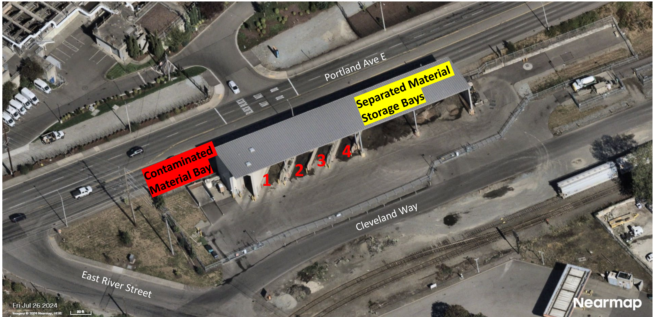
Example of Facility the Port will Build: City of Tacoma's Cleveland Way Decant Facility