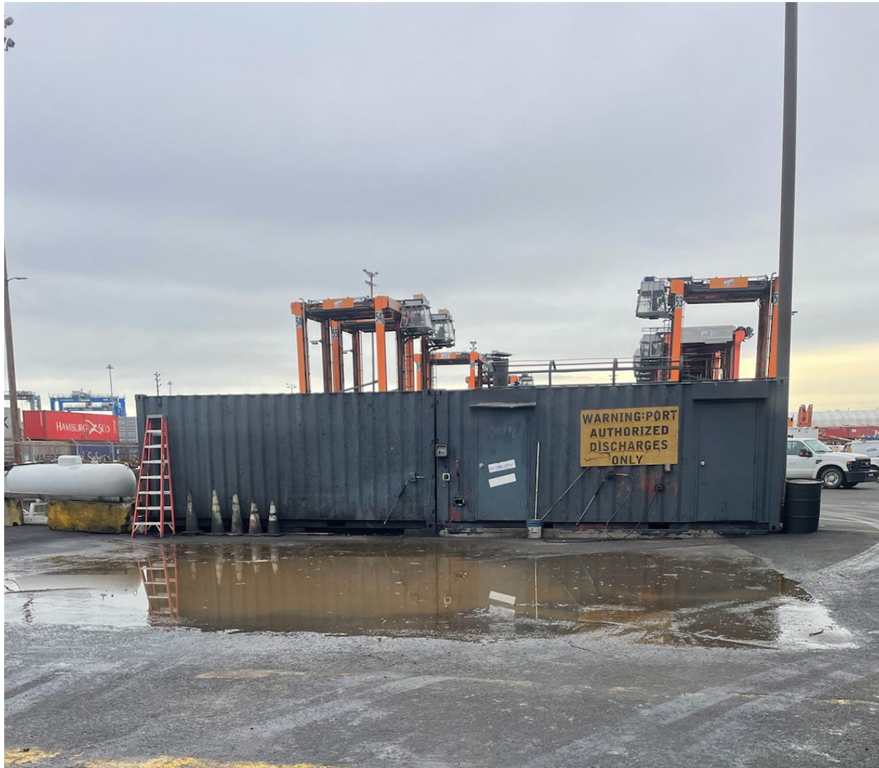
Dump Pit – Beginning of the Port's Wastewater Treatment Facility